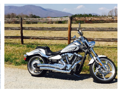
All Carver ATV/UTV, Snowmobile, and Motorcycle Covers are all rolled and packaged with the front end of the cover to the outside. The tag on the front end is sewn to the inside of the cover for easy identification.

BEFORE INSTALLING COVER - Please be sure that your unit is clean. Soiled covers cannot be exchanged or refunded.